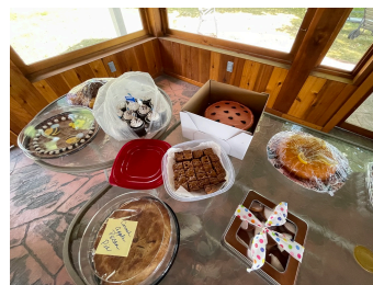
Goodies donated for the Sweet Walk